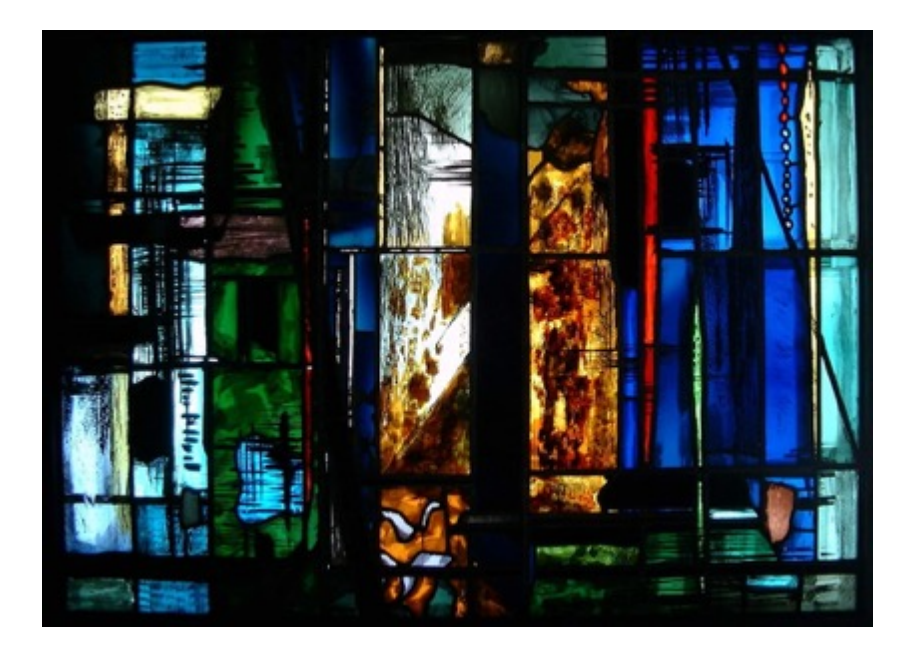
Experimental Panel, designed by John Piper and made by Patrick Reyntiens, c.1956 (ELYGM:L2003.8)

One of our favourite stained glass panels at The Stained Glass Museum is a collaboration between two British artists, John Piper and Patrick Reyntiens. The experimental panel they made together is bold, a blaze of primary coloured glass held within a grid of rectangular black lead lines. We love how the colour gets more complicated the closer you look, revealing how each block is composed of many shades and layers. Reyntiens hand painted each piece of glass to add texture and depth to its colour, and to create softness and shadow within its frame. Light seems to dance through it.